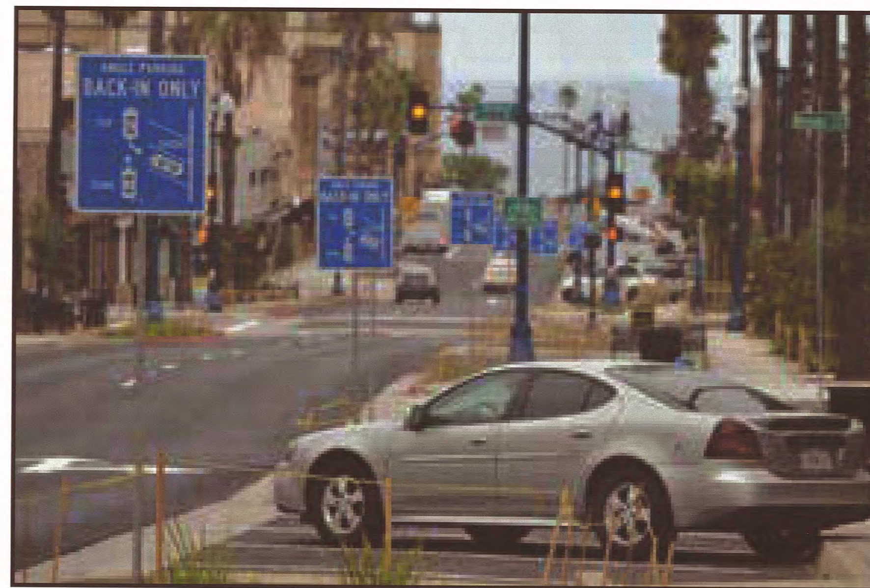
Back-in Angle Parking