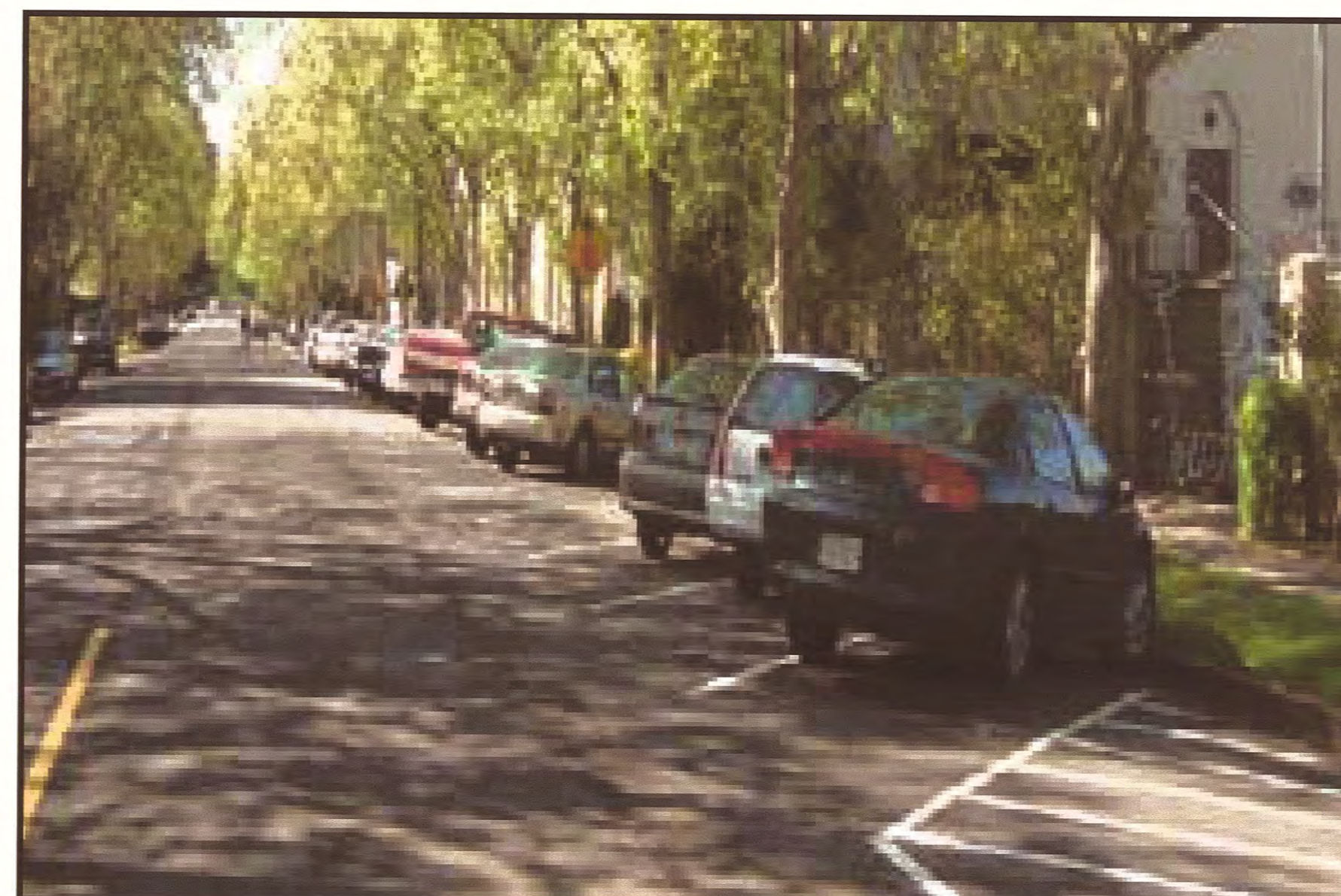
Front-In Angled Parking