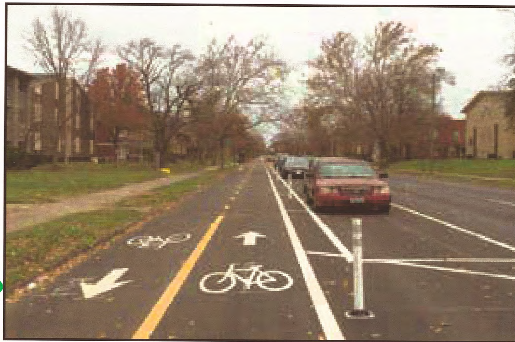
Bi-Directional Cycle Track